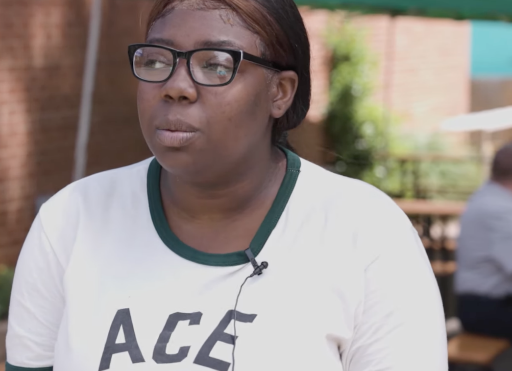
ASANTAY COMMUNITY MEMBER